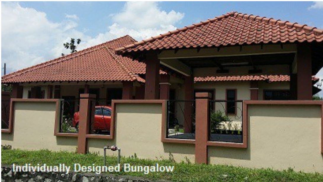
Individually Designed Bungalow