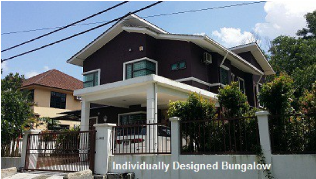
Individually Designed Bungalow