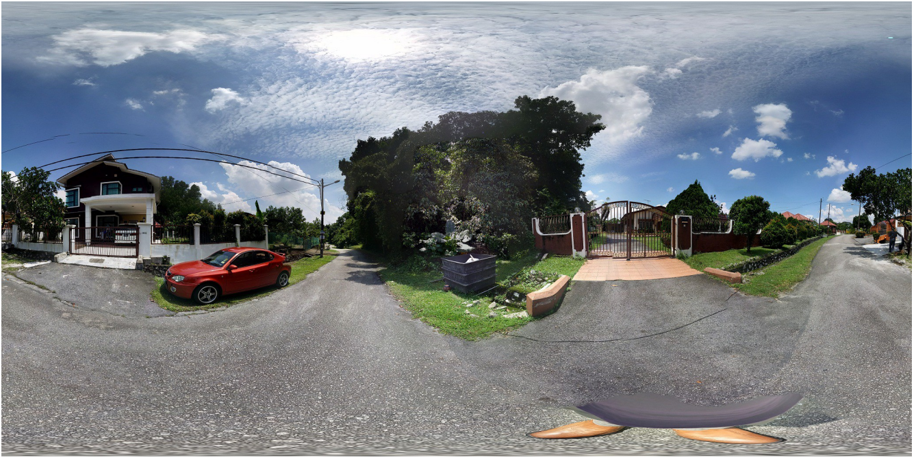
14. PANORAMA 360° SURROUNDING AREA OF SUBJECT PROPERTY